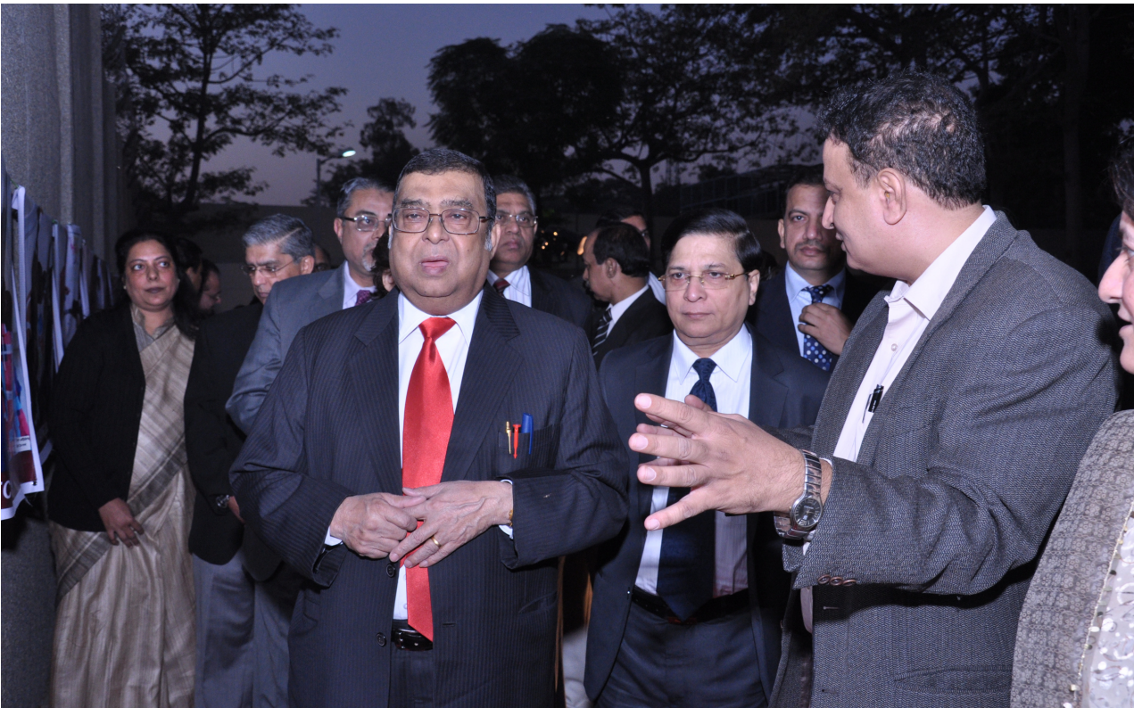
Visit to JDRC by Shri Altamas Kabir Hon'ble Chief Justice of India , Mr Justice Dipak Misra Chief Justice of the hon'ble High Court of Delhi and Ms Mukta Gupta sitting Judge of the Hon'ble Delhi High Court

SPYM manages and operates the program to reform and rehabilitate juveniles in conflict with the law and drug dependency, in partnership with the Department of Women and Child Development, Govt. of National Capital Territory of Delhi at De-addiction cum Rehabilitation Centre for Juveniles in Conflict with Law. The centre is the first initiative in India to work with this specific target group.