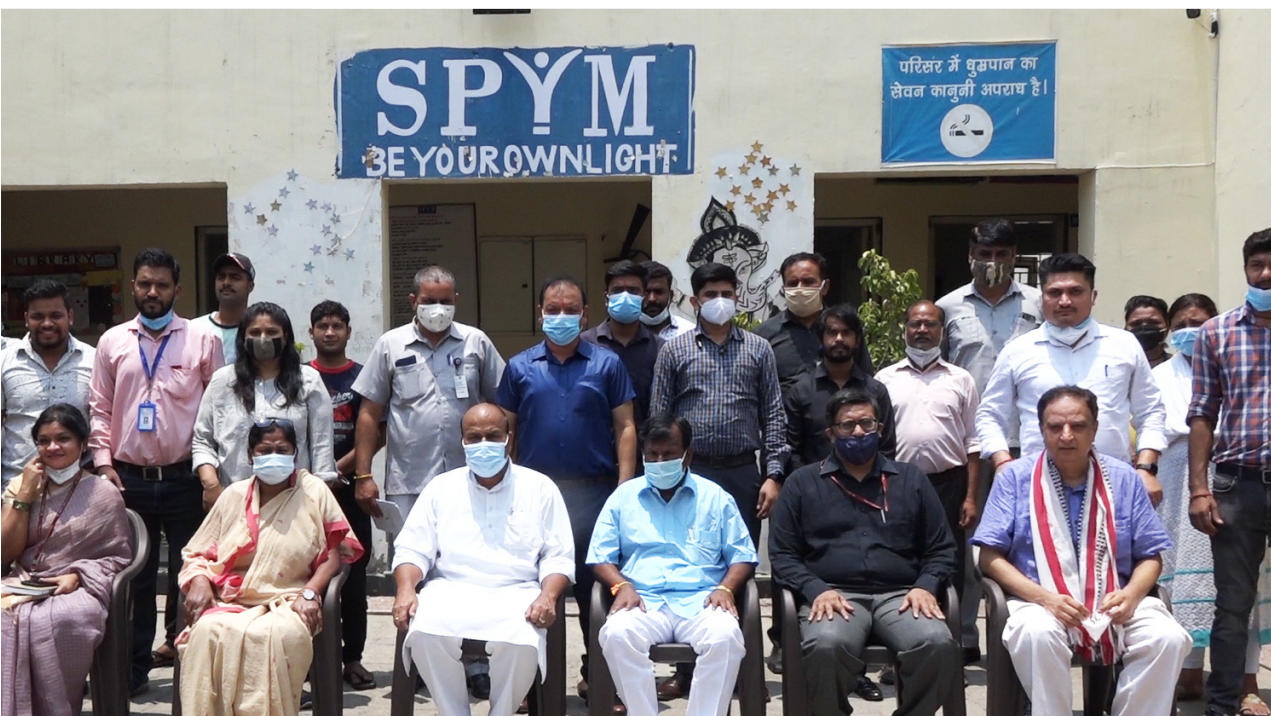
Visit to JDRC by officials of the Ministry of Social Justice and Empowerment (MSJE), Govt of India

SPYM manages and operates the program to reform and rehabilitate juveniles in conflict with the law and drug dependency, in partnership with the Department of Women and Child Development, Govt. of National Capital Territory of Delhi at De-addiction cum Rehabilitation Centre for Juveniles in Conflict with Law. The centre is the first initiative in India to work with this specific target group.