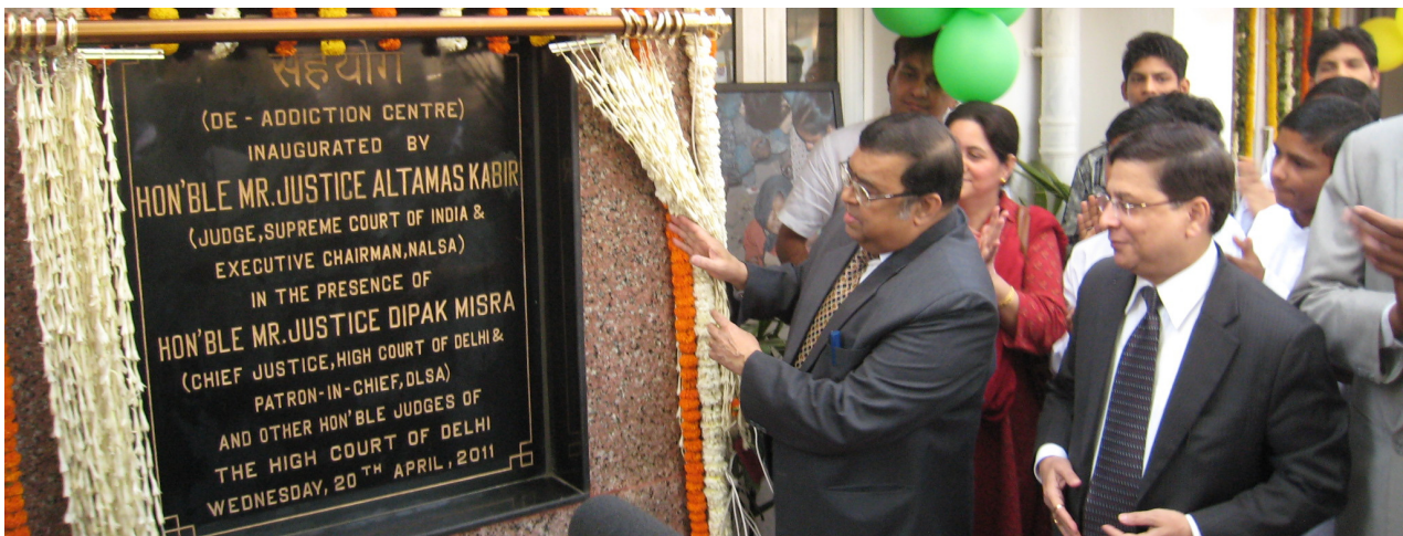
JDRC inauguration by Shri Altamas Kabir Hon'ble Chief Justice of India and Mr Justice Dipak Misra Chief Justice of the hon'ble High Court of Delhi

In 2005, the Honourable High Court of Delhi made a judgement, resulting in the formation of the Juvenile Justice Committee (JJC) to address juvenile justice in regard to substance use. In 2010, the JJC of the Delhi High Court approached the Society for Promotion of Youth and Masses (SPYM) to open the first and only juvenile de-addiction centre in India.