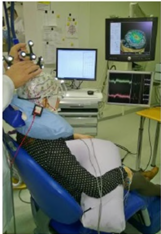
Figure 1. TMS-EEG.

1 Department of Adolescent Psychiatry, Kuopio University Hospital 2 Doctoral Programme of Clinical Research, School of Medicine, University of Eastern Finland 3 Brain Stimulation Laboratory, Department of Psychiatry and Behavioral Sciences, Stanford University School of Medicine 4 Department of Clinical Neurophysiology, Kuopio University Hospital 5 Department of Clinical Radiology, Kuopio University Hospital 6 Department of Psychiatry, School of Medicine, University of Eastern Finland 7 Department of Neurology, Università Campus Bio-Medico di Roma 8 Department of Clinical Neurophysiology, Institute of Clinical Medicine, Faculty of Health Sciences, University of Eastern Finland